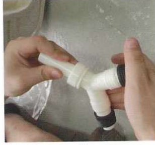
8. Install the sewage connection pipe