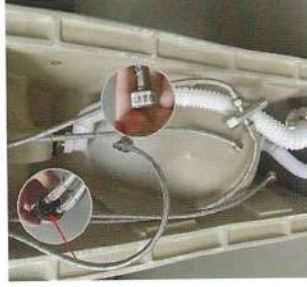
5. The outlet hose is installed at the middle interface