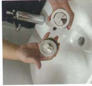
6. Install upper and lower drains