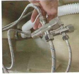
9. Cold and hot inlet pipe connection