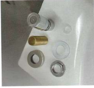
3. Install nozzle