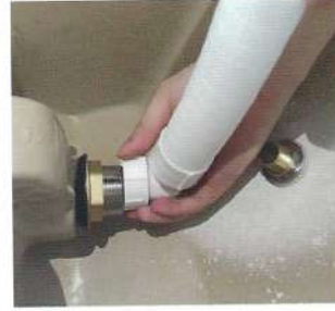
7. Install pvc pipe