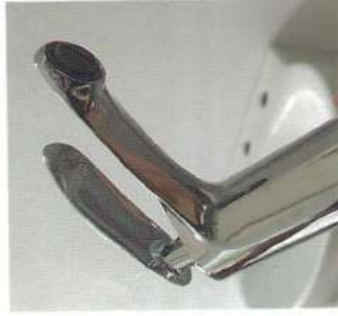
1. Faucet installation