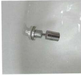
4. 360 degree nozzle