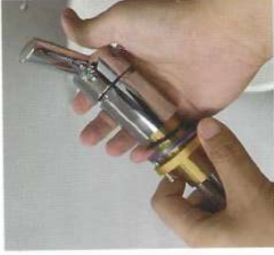
2. Install Switch valve